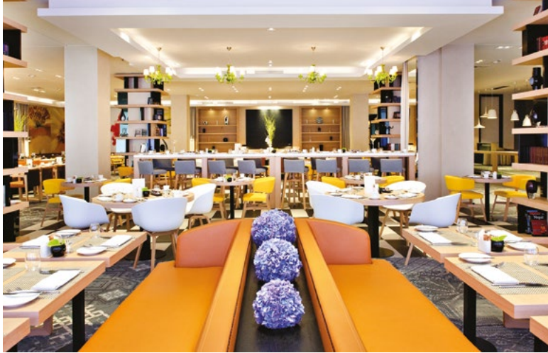
The Kitchen Gallery restaurant